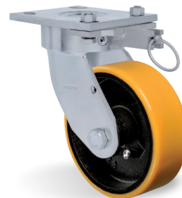
Swivel Lock - AD