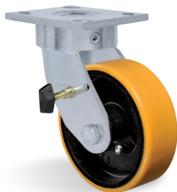
Side Brake - FL