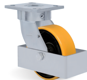
Caster Guard - GC