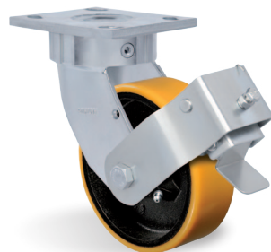
Pedal Brake - FP